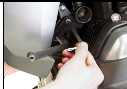
5 Position each Light Mount as shown. Apply a small amount of blue Loctite to screw threads and fasten with supplied hardware.