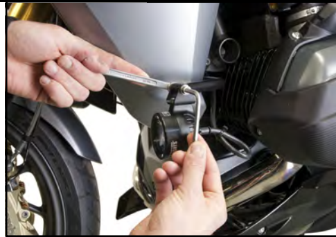
1 Disconnect lights from stock mounting bracket. Connecting wire can be used to hold lights while mounts are being replaced.

* IF YOUR BIKE DOES NOT YET HAVE AN AUXILIARY LIGHT KIT INSTALLED, DISREGARD STEPS 1-3.