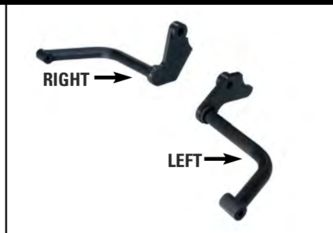
4 To mount AvantGuard Light Bars, first determine correct orientation of parts. The left side Light Mount, must be fitted to left side of the bike and vice versa.

WARNING AND DISCLAIMER: All parts manufactured, designed or sold by Machineart Moto ("MaMo") should be installed by a qualified motorcycle technician. The risk of injury is increased by improper installation or misuse of equipment. MaMo's customers must exercise good judgment in the use, control, alteration, part selection and installation, and maintenance of their motorcycles. In the event of a possible defect in material or design, or any other defect in a part manufactured, designed or sold by MaMo, the responsibility of MaMo is limited to a refund of the purchase price or the replacement of the part if MaMo determines the part to be defective, and subject to MaMo's inspection of the part within thirty (30) days from the date of purchase. (Note: any attempted repairs or modifications made to MaMo products will void this limited warranty). MaMo, under no circumstances will be responsible for incidental and/or consequential damages, property damage, personal injury damage, or damage, injury, cost or expense of any kind or nature whatsoever except as provided by law. MaMo makes no other warranty, express or implied, including without limitation any warranties of merchantability and fitness for a particular purpose.