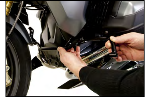
3 Carefully, remove stock bar.

WARNING AND DISCLAIMER: All parts manufactured, designed or sold by Machineart Moto ("MaMo") should be installed by a qualified motorcycle technician. The risk of injury is increased by improper installation or misuse of equipment. MaMo's customers must exercise good judgment in the use, control, alteration, part selection and installation, and maintenance of their motorcycles. In the event of a possible defect in material or design, or any other defect in a part manufactured, designed or sold by MaMo, the responsibility of MaMo is limited to a refund of the purchase price or the replacement of the part if MaMo determines the part to be defective, and subject to MaMo's inspection of the part within thirty (30) days from the date of purchase. (Note: any attempted repairs or modifications made to MaMo products will void this limited warranty). MaMo, under no circumstances will be responsible for incidental and/or consequential damages, property damage, personal injury damage, or damage, injury, cost or expense of any kind or nature whatsoever except as provided by law. MaMo makes no other warranty, express or implied, including without limitation any warranties of merchantability and fitness for a particular purpose.