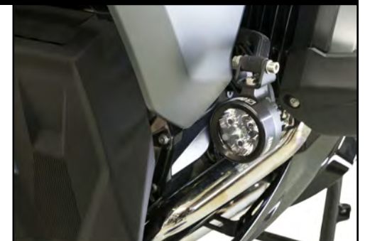
6 After Light Bars are secure, re-mount lights using existing hardware. Be sure to position the lights correctly and check fastener tightness before and after riding.